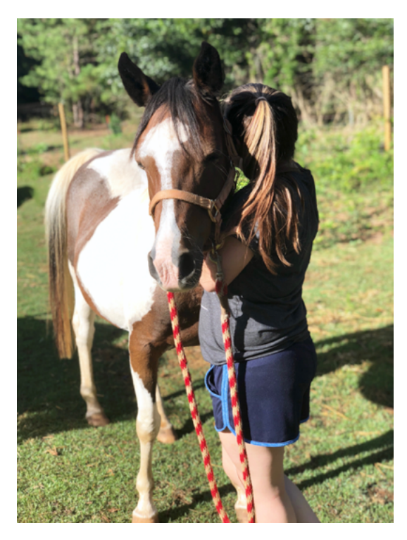
Jasmine Road Resident partaking in Equine Therapy at Black Sheep Farms